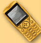
Cell phone with chargers, inverter or solar charger