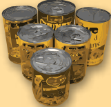
At least a three-day supply of non-perishable food. Manual can opener for cans