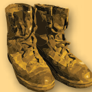
Seasonal clothing and footwear