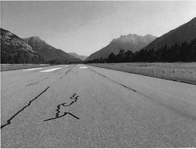
Photo 1: Low Severity Longitudinal Cracking near the Threshold or Rwy 05