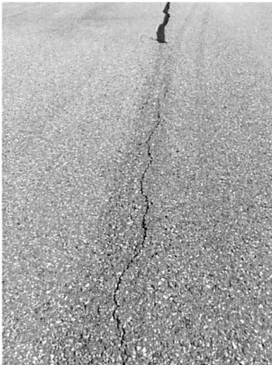
Photo 6: Low Severity Longitudinal Cracking Requiring Crack Sealant