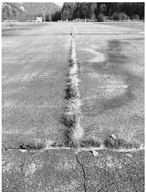
Photo 29: Sealant and Vegetation Removal Required on Itinerant Apron