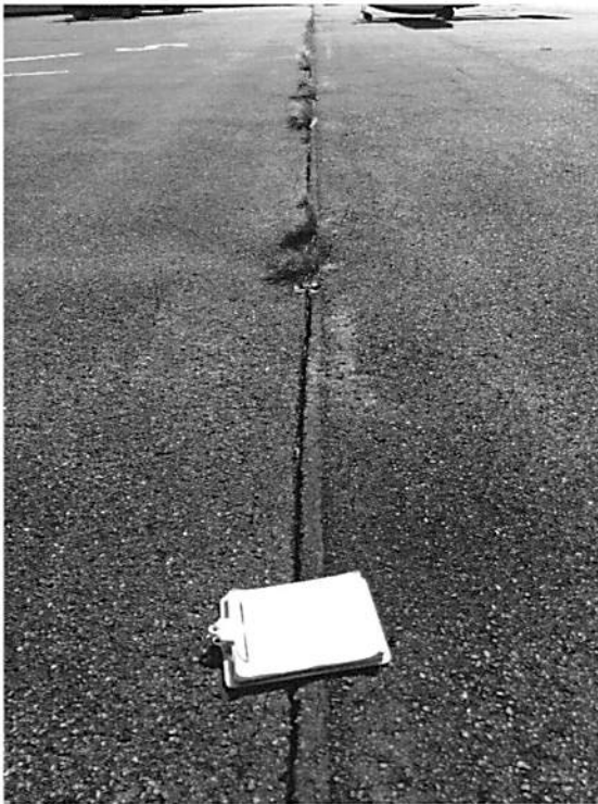
Photo 28: Sealant and Vegetation Removal Required on Itinerant Apron