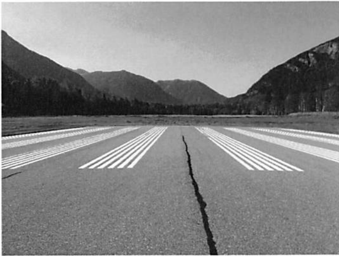
Photo 2: Low Severity Longitudinal Cracking near the Threshold or Rwy 05